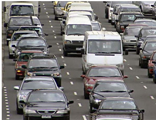
Bee Ridge Road meetings may bring improvements and urban transit.

The Coast2Coast Rx discount card is honored at all major chain pharmacies and many independent pharmacies. Although the card is not insurance, it can save people anywhere from 5 percent to 70 percent on virtually all generic and brand-name drugs. For more information, contact the Sarasota