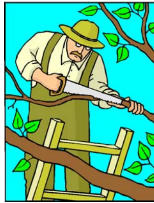
Learn about tree trimming at Feb 9 th county sponsored meeting.