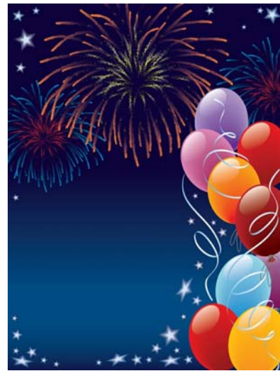
Hope your New Year is even better than last one.

Send us an email with your thoughts and suggestions ... we'll start publishing some of your concerns in upcoming newsletters. Send to: conasarasota@comcast.net