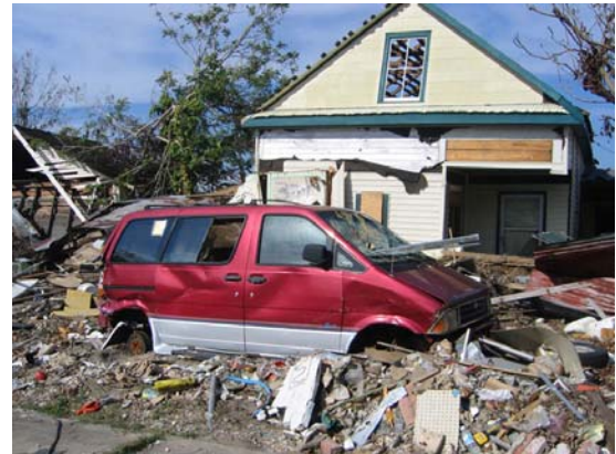
Hurricane damage can devastate a neighborhood and its residents.

Members of the public and the media, as well as CONA members are invited to attend. The meeting will be at The Sarasota Garden Club, 1131 Boulevard of the Arts, Sarasota (Corner of US 41 and Blvd of the Arts).