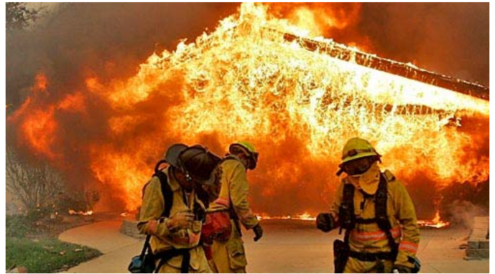
County official advises homeowners on ways to prevent loss of their homes through wildfire as pictures above

Just Go to our CONA website and download membership form www.conasarasota.org